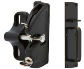
Push Button (U)